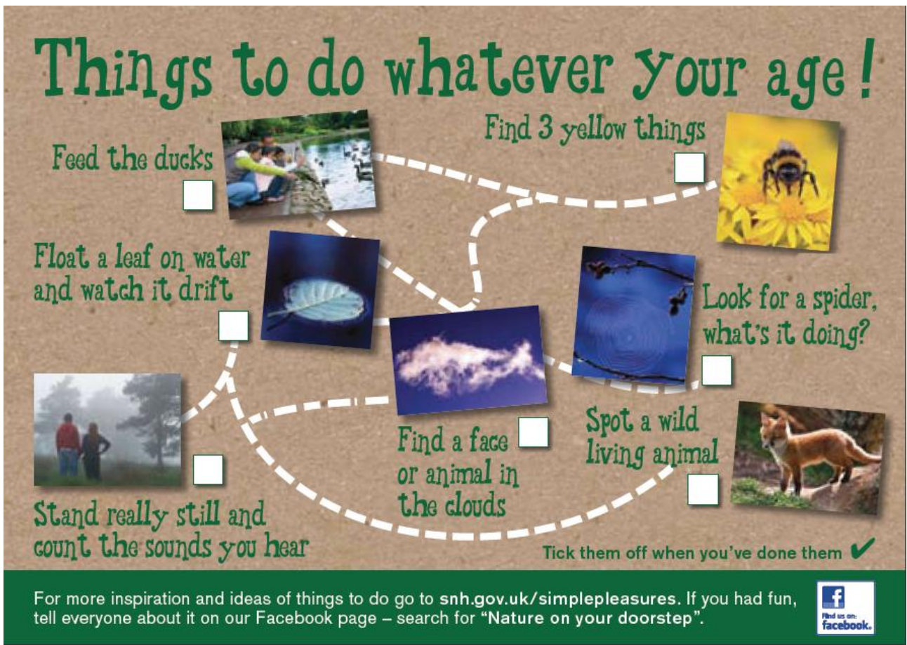
Typical activity organised by the Scottish SNH: 'Simple pleasures, easily found'.